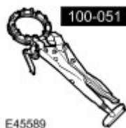
Pipe cutter-exhaust 100-051 (LRT-99-027)